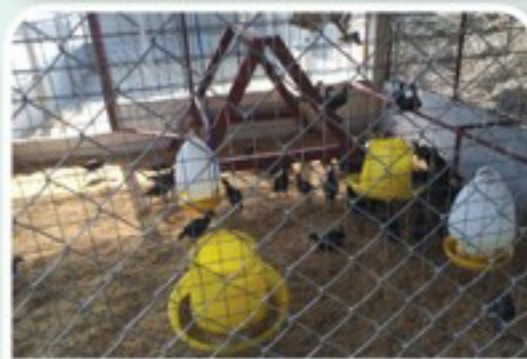
6.Native Chicken Farming