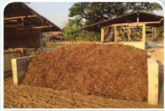
5.Compost fertilizer and Bio-Compost process.