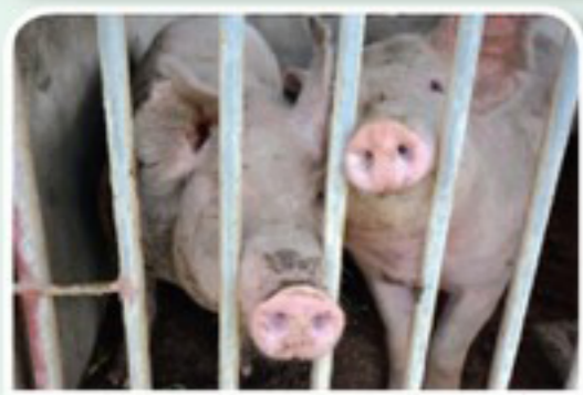
7.Applied live stock production(Swine).