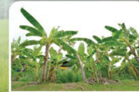
2. Banana field.