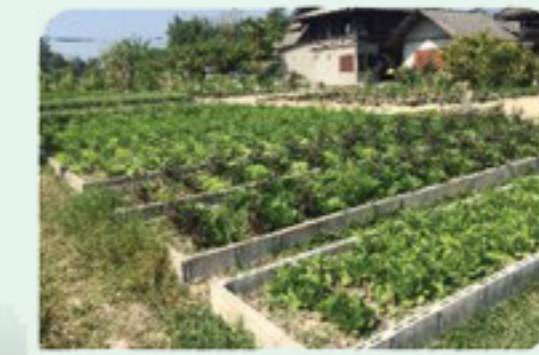
1. Vegetable products.